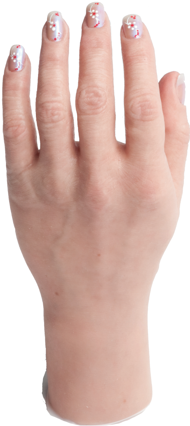
various options available